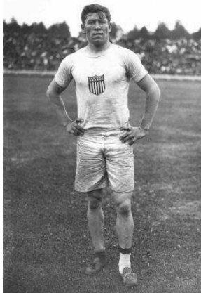
Olympian Jim Thorpe